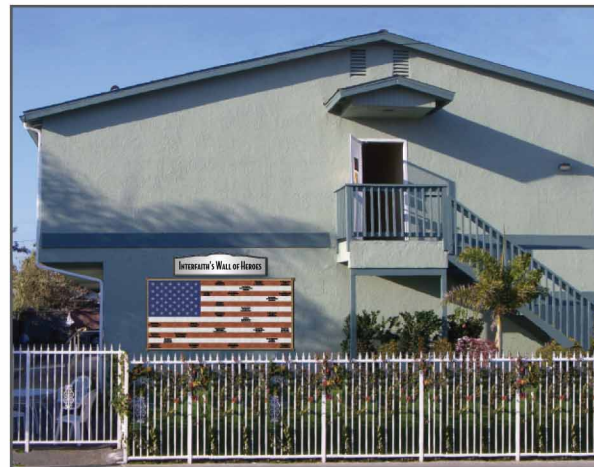
Located at Interfaith's Veterans Housing at 1234 Division Street, in Oceanside.